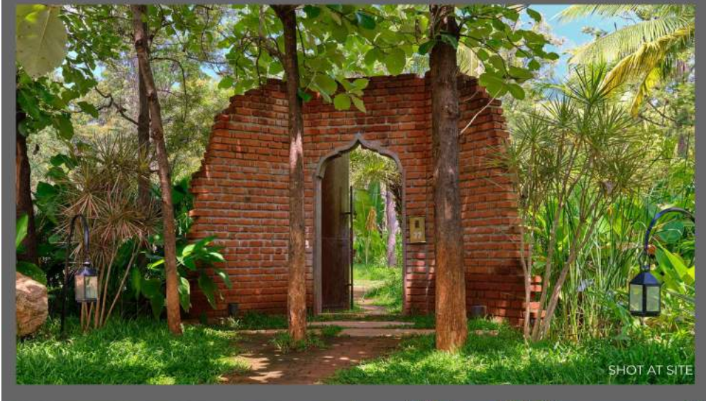
SHOT AT SITE