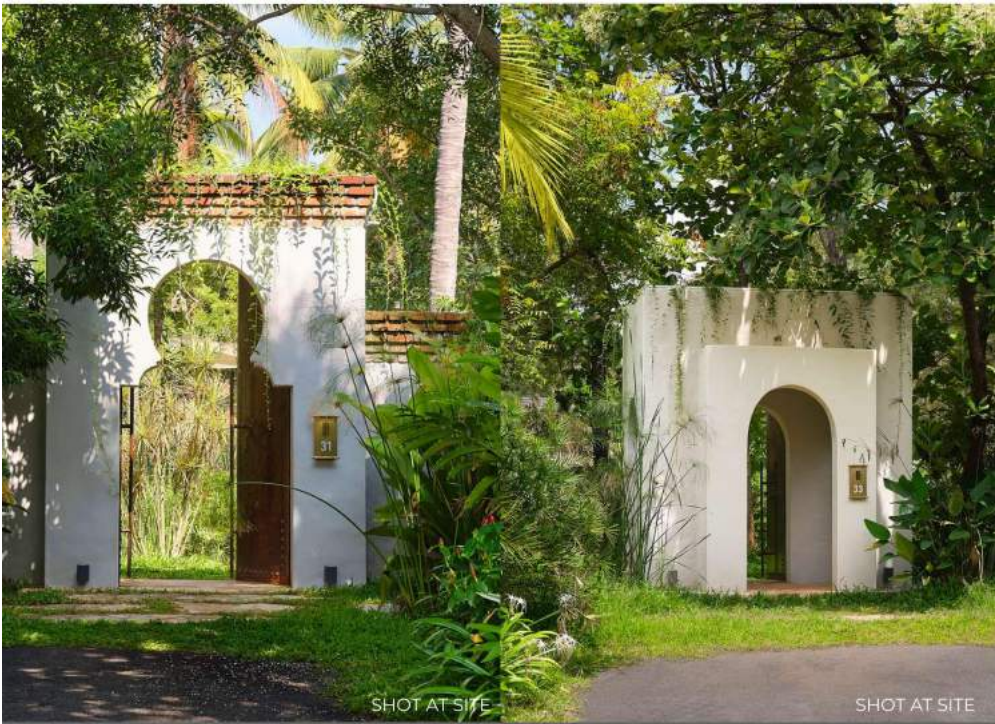
SHOT AT SITE