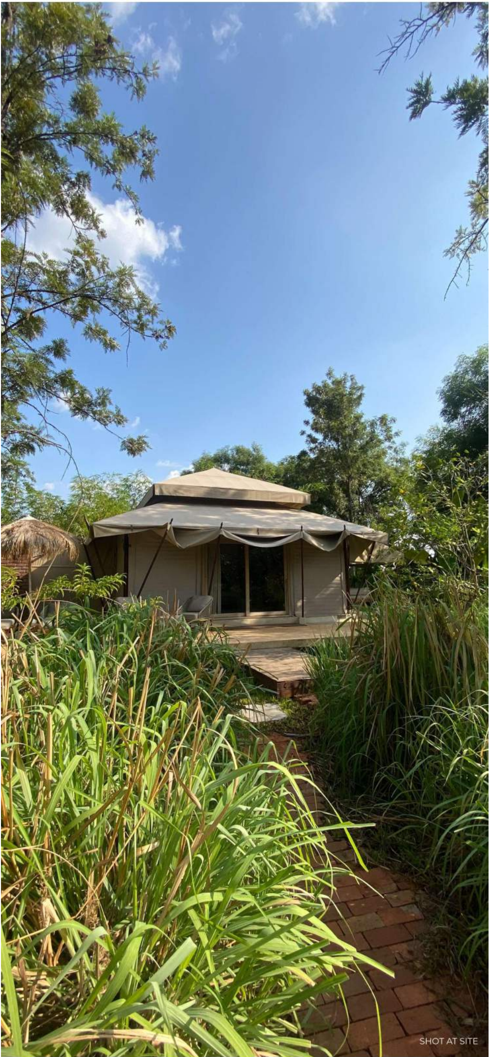
SHOT AT SITE