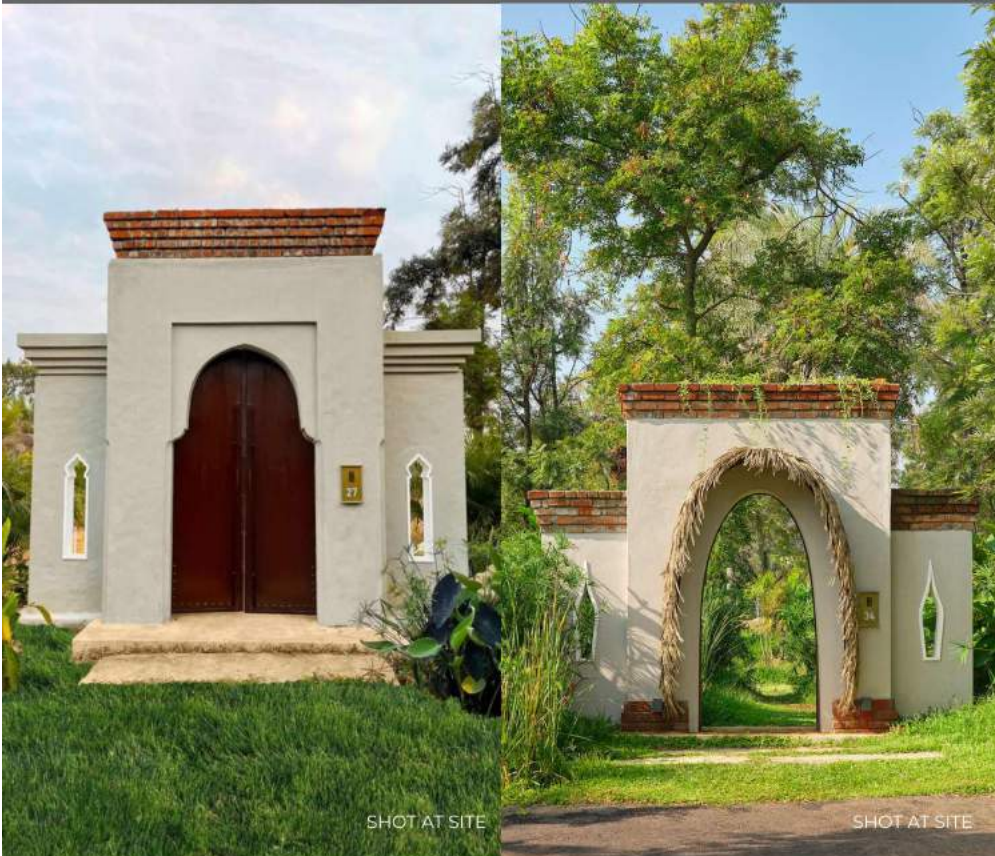
SHOT AT SITE